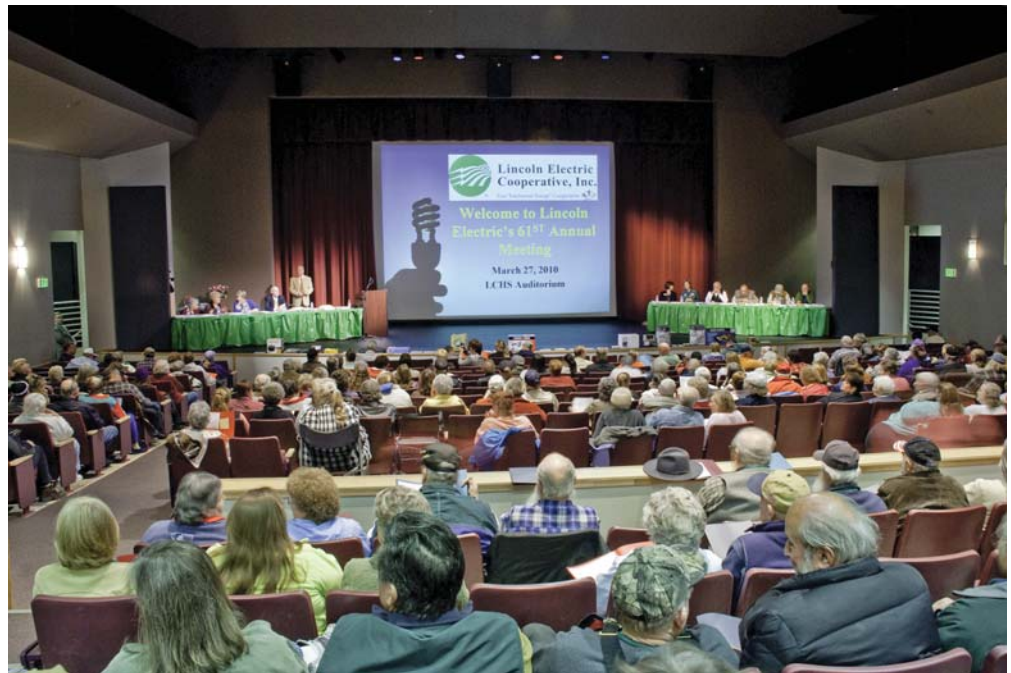
A good crowd was on hand for the meeting with 362 registered members and 86 guests.